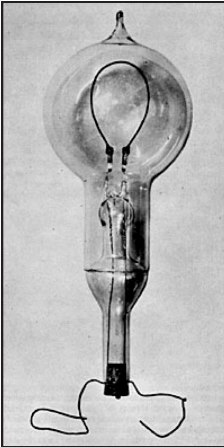
Edison's Electric Light Bulb. Rutgers. "Thomas A Edison Papers. http://edison.rutgers.edu/lamp.htm