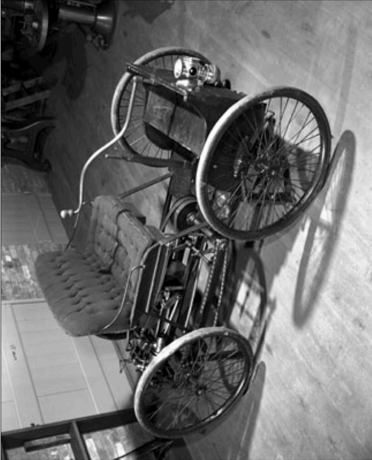
Henry Ford's Quadricycle. https://corporate.ford.com/company/history.html