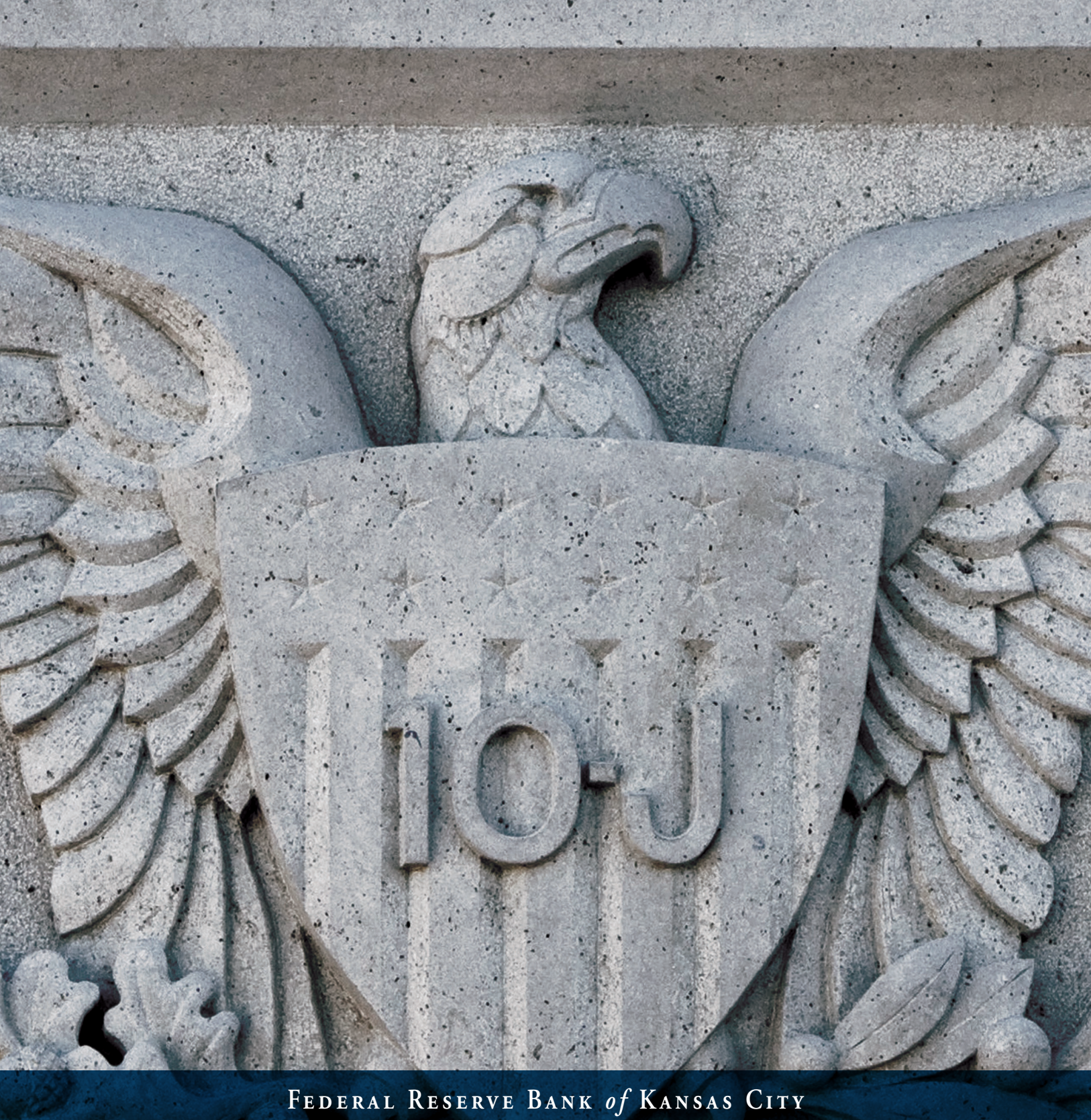
Federal Reserve Bank of Kansas City 2024 Program Guide for Tenth District Financial Institutions