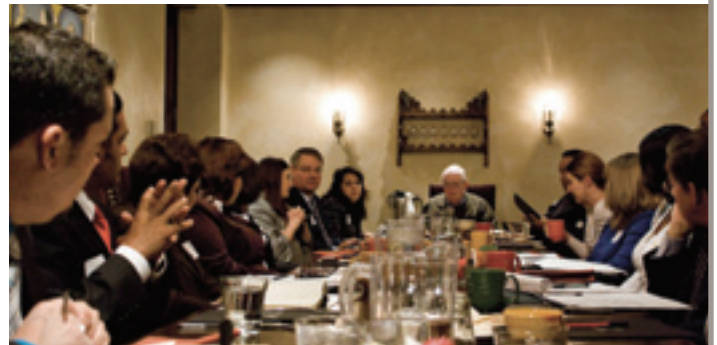
Congressional staff members in New Mexico engaged in discussion with officials from major mortgage servicer companies about the impact of foreclosures on constituents.