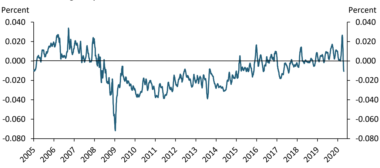
Chart 1: The Average G-Spread

backed commercial paper that led to severe financing strains for banks and other financial institutions.<sup>2</sup> Although recent financial strain emanated from a different source, the first quarter of 2020 also saw the Treasury market experience a sudden bout of severe illiquidity. Plunging oil prices and the COVID-19 outbreak fueled concerns about the macroeconomic outlook and uncertainty about the implications for financial markets, motivating investors to swiftly sell Treasury securities to raise cash in their portfolios.