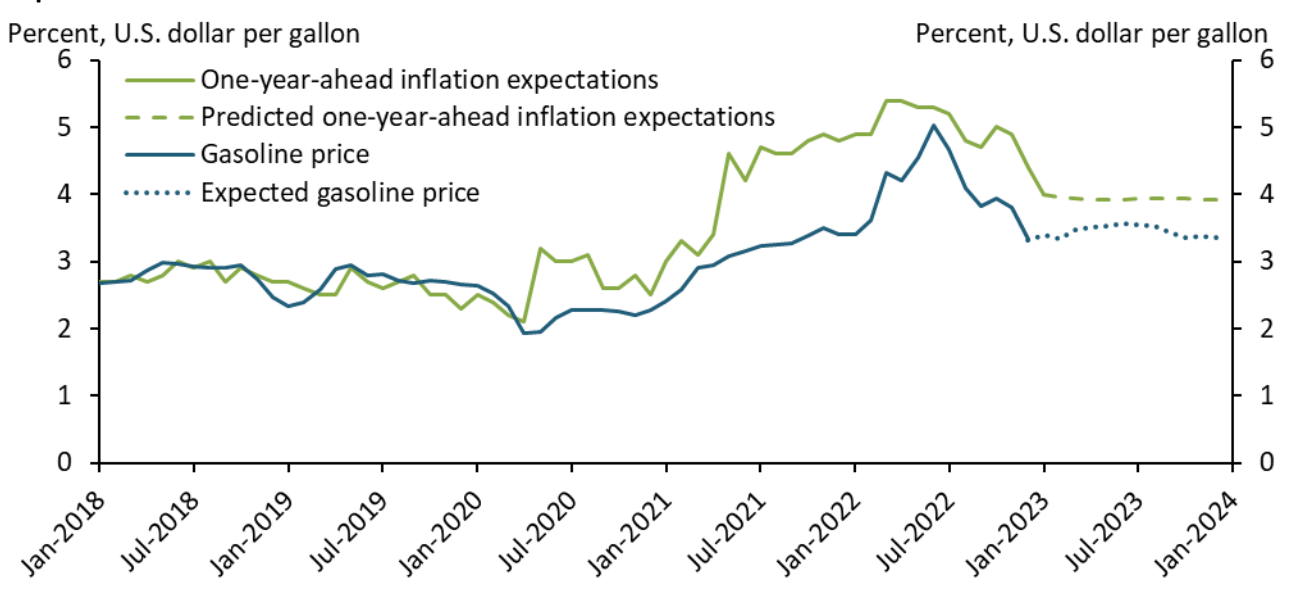
Chart 3: Relatively stable gasoline prices could bring relatively stable one-year-ahead inflation expectations

Notes: The gasoline price projection is from the January 2023 Short-Term Energy Outlook. Predicted one-yearahead inflation expectations are based on the coefficient estimates of different inflation expectation groups presented in Çakır Melek, Dillon, and Smith (2022).